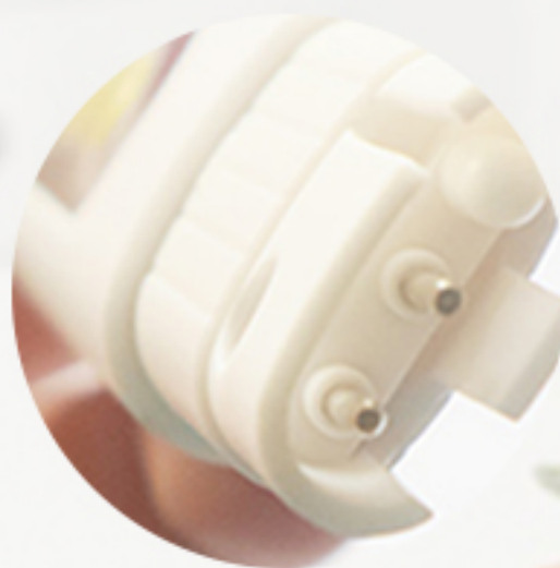
Titanium alloy sensitive probe