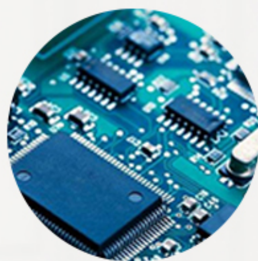
Optimize smart chip