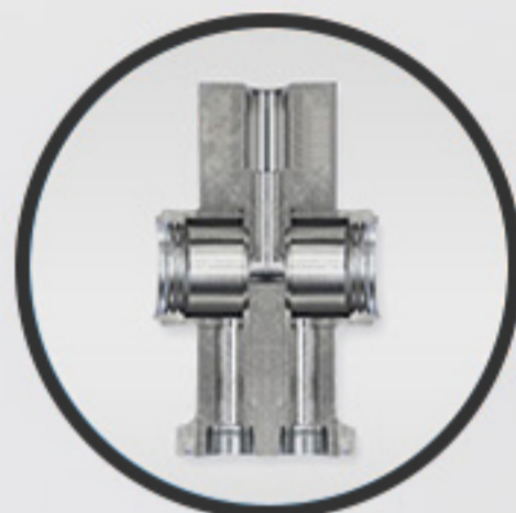
Lead-free faucet profile