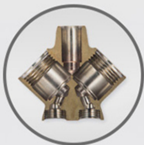
Ordinary faucet profile

Ensure water quality and protect children's healthy growth