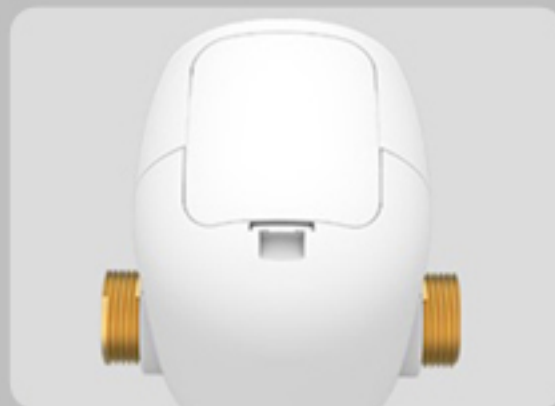
Internal power supply

3-point sewage discharge interface fast sewage discharge