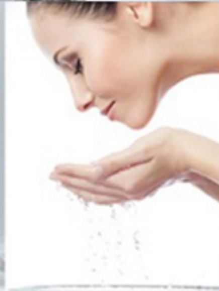
face wash water