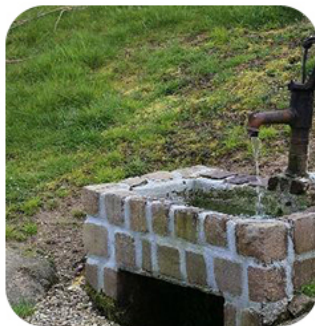
Rural water purification