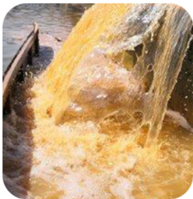
Yellow mud water purification