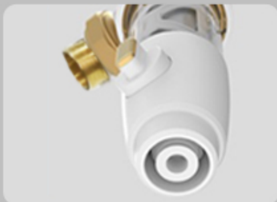
Knob drain switch