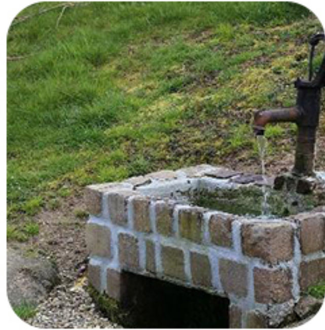
Rural water purification