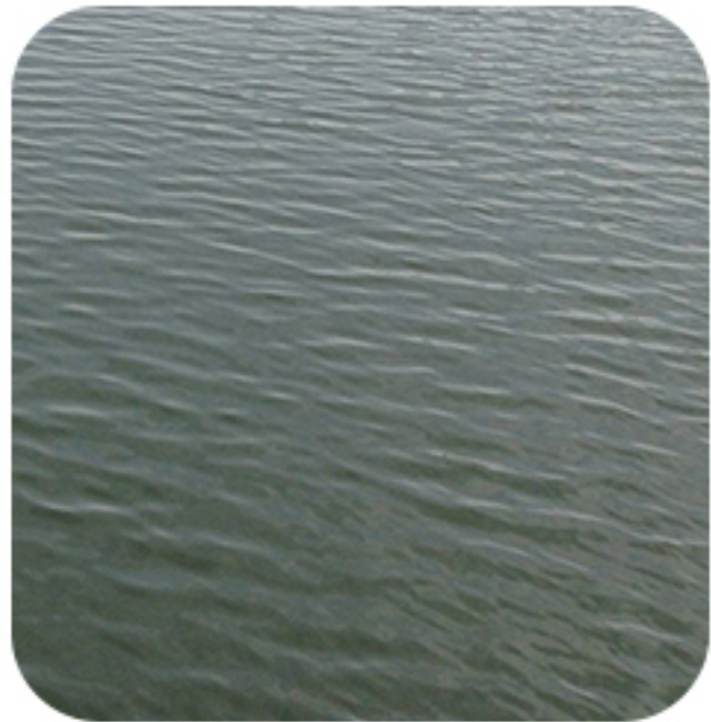
River water purification