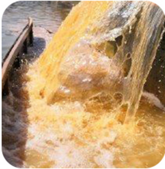
Yellow mud water purification